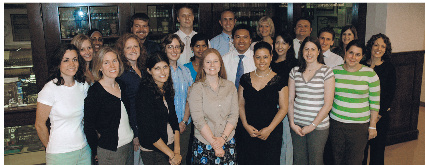
Residency Class of 2007-08