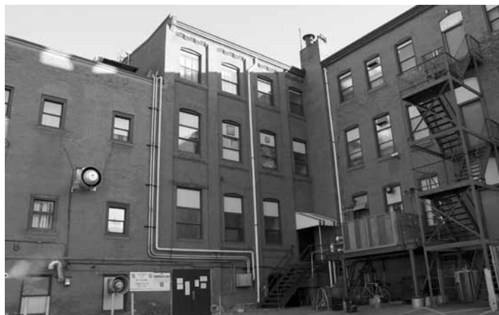
The Birmingham Free Clinic, located at the Salvation Army Adult Rehabilitation Center on Pittsburgh's South Side, is one of two Grace Lamsam Pharmacy Program sites that receives support for diabetes care through the Rite Aid Foundation.