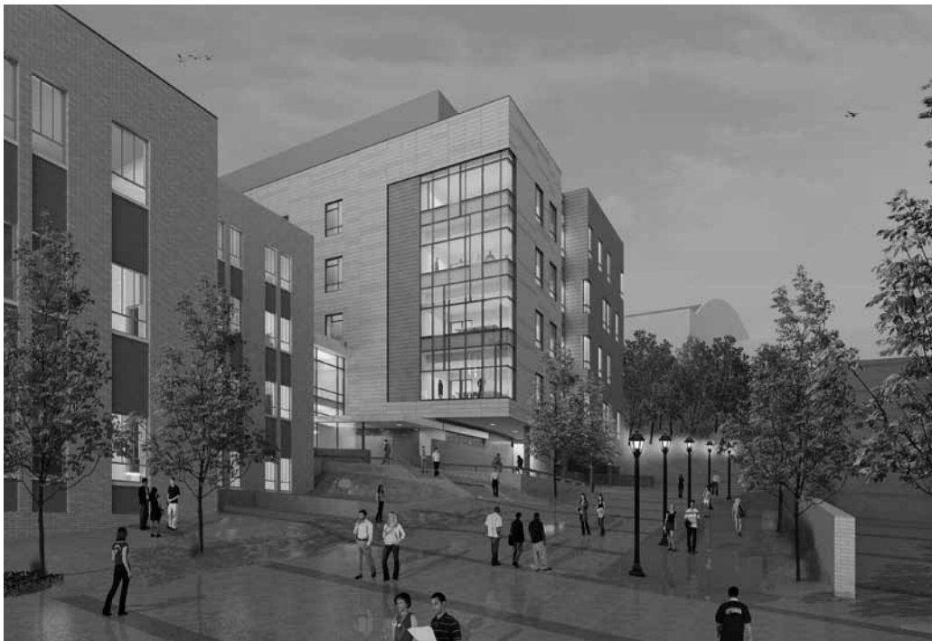
Illustration of the new construction project: the six-story Salk Pavilion and the Commons.

You might be wondering what building is pictured on the front cover. What you see is the new look of the School of Pharmacy. As you already know from previous Pitt Pharmacy issues, the University of Pittsburgh and the School of Pharmacy have embarked on the historic opportunity to construct Salk Pavilion, which will connect to Salk Hall by a commons. The Pavilion will be the first new construction for the School of Pharmacy in its 132 year history. Needless to say, the excitement among faculty, staff, and students is high.