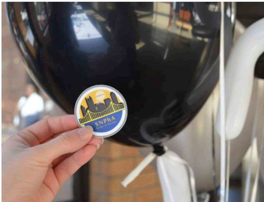
Pictured on the left: Official SNPhA sticker that was handed out at the Region I and II Conference.

SNPhA will be hosting elections in early April. Be on the lookout for information regarding positions along with any other information. If you have any questions, concerns, or ideas, please be sure to reach out to the executive board through our Facebook page (@SNPhA.Pitt) or email snpha.pitt@gmail.com .