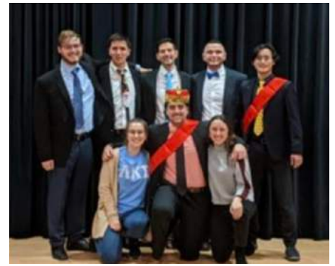
Pictured above: LKS co-chairs with our fabulous Dr. Salk Hall contestants.

Lastly, please extend a warm welcome to our new officers for the 2020-2021 school year and congratulations to those who earned a position! We have full faith that our chapter will continue to do amazing things in the hands of these lovely ladies. Can't wait to see what these ladies will do in their new roles and the continual growth of our chapter under the new leadership.