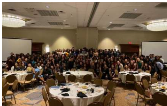
Pictured above: SNPhA members arrive for the Region I and II Conference at the Sheraton Hotel in Station Square, Pittsburgh.