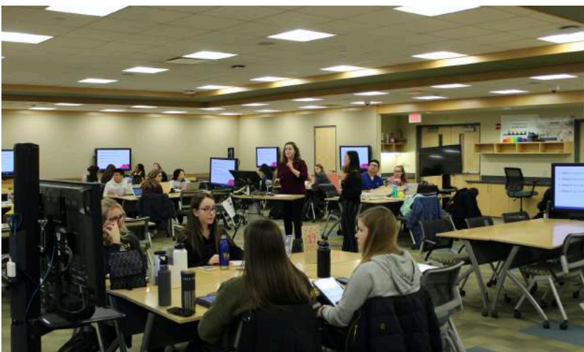
Pictured on the left in both photos: P1s speak with ASCP members regarding their upcoming SilverScripts experience.