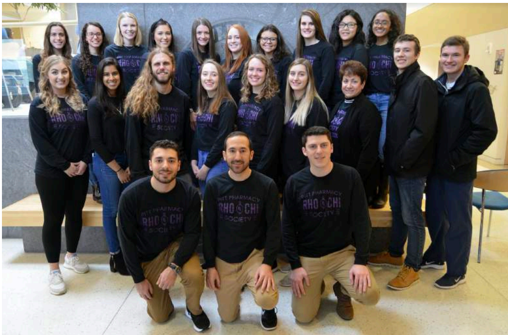
Pictured on the left: Rho Chi members from the Class of 2021.

Looking forward to April, the annual Tucci-Koch Lecture will take place on Wednesday, April 1. More details are to follow in the upcoming month. Good luck to everyone as we finish the semester strong!