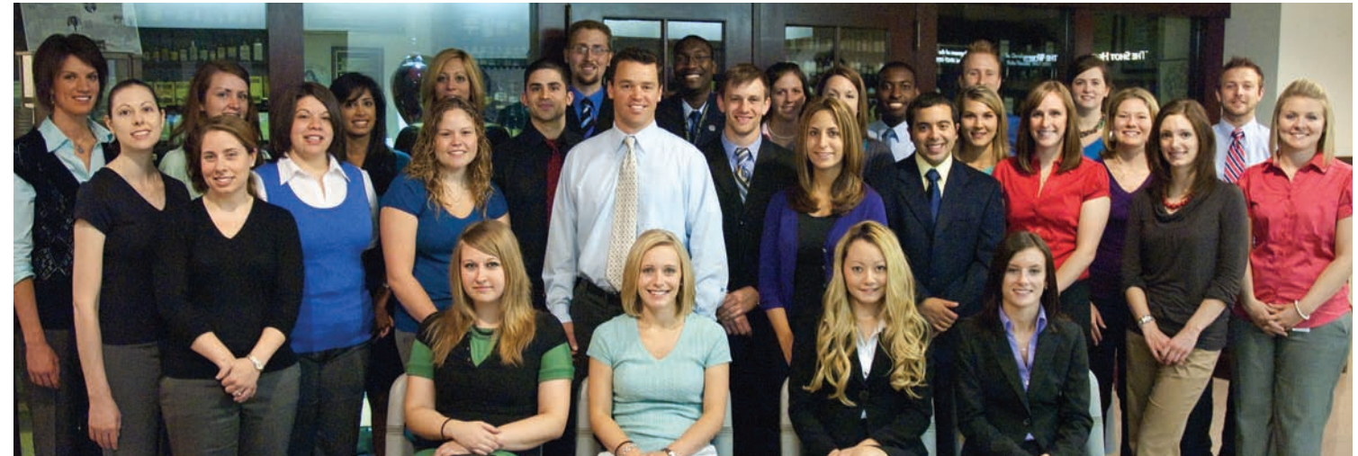
Residency Class of 2009-10