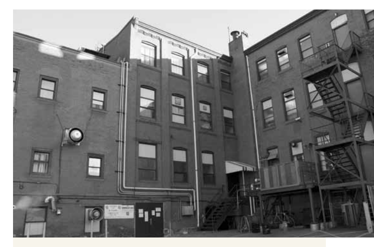
The Birmingham Free Clinic, located at the Salvation Army Adult Rehabilitation Center on Pittsburgh's South Side, is one of two Grace Lamsam Pharmacy Program sites that receives support for diabetes care through the Rite Aid Foundation.