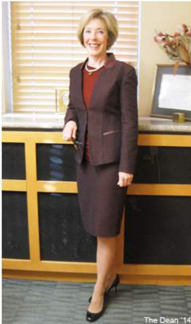
The Dean '14