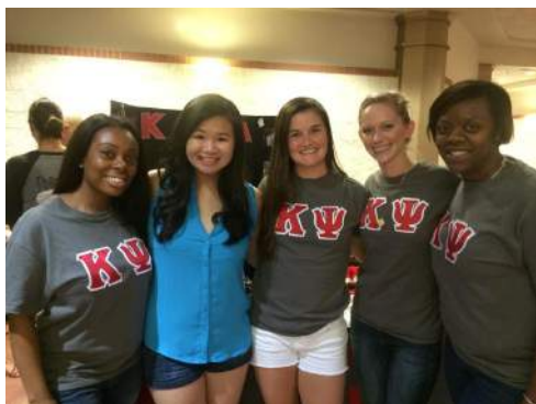
Brothers from our chapter and the Delta Epsilon chapter at Duquesne mingles

On the regional level, our chapter is looking forward to the Mountain East Province Fall Assembly at the Wyndham University Center on campus. This is a regional meeting where brothers from all over the country and the region attend in order to build the bonds of brotherhood and exchange ideas to help better our organization. We are excited to have 31 brothers attending this regional meeting and can't wait to meet other brothers from around the country.