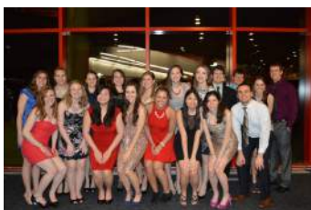
Left: P3 Brothers at Kappa Psi Formal

Many brothers will be attending this semester's Kappa Psi Province Meeting in Baltimore, MD in April. We look forward to meeting other pharmacy students and pharmacists from around the region. Highlights of the weekend will include a wing-eating contest and dinner at the Baltimore Aquarium. Some brothers will be traveling to Denver, CO this summer for Kappa Psi's national meeting.