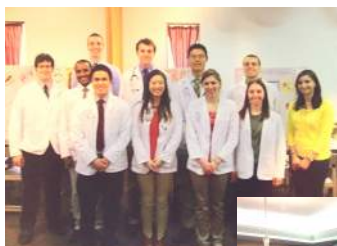
SNPhA Members at the Uniontown Health Fair