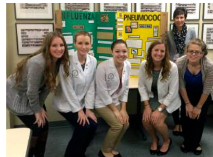
Up: SSHP members at WPIC immunizations presentation.

We are excited for the upcoming school year and can't wait to meet you and your class. If you are interested in joining, we will be holding our first general body meeting on August 8 th at noon or contact us at snpha.pitt@gmail.com . Hope to see you at the Back to School Picnic!