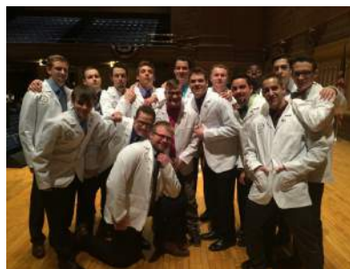
PDC brothers at White Coat Ceremony

Phi Delta Chi, otherwise known by the Salk Hall brethren as PDC, is one of three pharmacy fraternities at Pitt. Unlike Lambda Kappa Sigma or Kappa Psi, PDC is one of the few pharmacy frats remaining that is comprised of all dudes. PDC prides itself in promoting both social and professional bonds. As you walk through Salk Hall, you will see every brother looking after one another and always lending a hand; it is through our motto: "Each Needs the Help of the Other" that we are able to foster such unparalleled brotherhood.