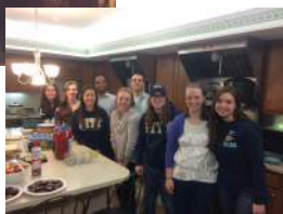
SNPhA members and pre- pharmacy students at McKee Place Family House

The Student National Pharmaceutical Association (SNPhA) is excited for the upcoming busy 2015-2016 school year! SNPhA addresses pharmacy and healthcare-related issues and the poor minority patient population by developing programs and events to improve the community.