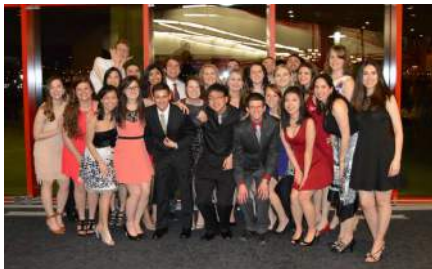
KY Brothers at Spring Formal

CONGRATULATIONS! On Aug 6 th , 2015 in Denver, Colorado, the Beta Kappa Chapter of Kappa Psi at Pitt won Chapter of the Year! –It is the 4 th time that Beta Kappa won since 2002.