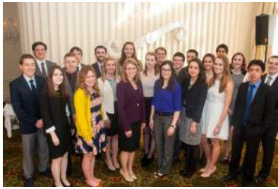
Rho Chi 2015 Inductee

reach out to any of the Rho Chi members; we're here to help you in during this exciting academic