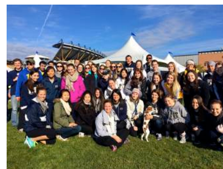
Down: SSHP members at Step Out Walk against Diabetes