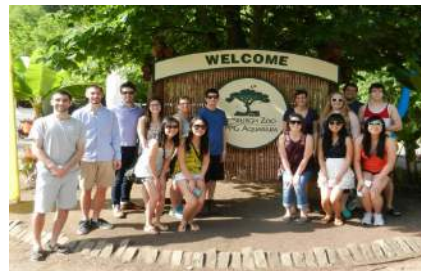
Brothers hanging out at the Pittsburgh Zoo.

After a busy summer of getting in those intern hours, reading the active ingredients on sunscreen bottles and poison ivy lotions, and somehow finding time to relax before classes begin, the sisters of Lambda Kappa Sigma are ready to jump back into another exciting year of successful fundraisers, professional projects, and social events.