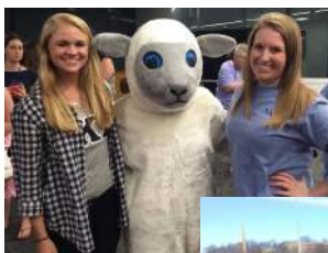
Up: LKS convention in St. Louis

But most importantly, WELCOME TO THE FAMILY P1's! We are excited for you to embark on the tireless, but rewarding, journey of pharmacy school with us! Despite the unfortunate fact that "blow-off" classes no longer exist, we want to help make your transition into pharmacy school as painless as possible, so do not hesitate to approach any of the sisters for more information on our awesome organization and school in general. We look forward to meeting you all! For more information about our chapter, like us on facebook (PittLKS), and follow us on twitter and instagram (@LKSDeltaChapter)- we follow back.