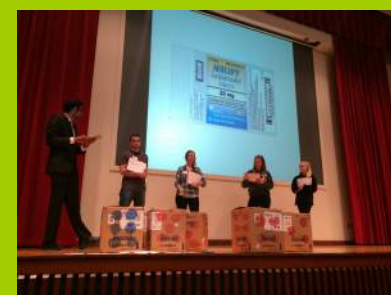
Contestants for The Price is Right: Pharmacy Edition!

One event we hold during the year is "The Price is Right: Pharmacy Edition!" where students had the opportunity to play in a game show to guess the price of different types of medications and win some cool prizes along the way! We are always brainstorming for new events to hold, and we are open to anyone that wants to join the committee or offer ideas!