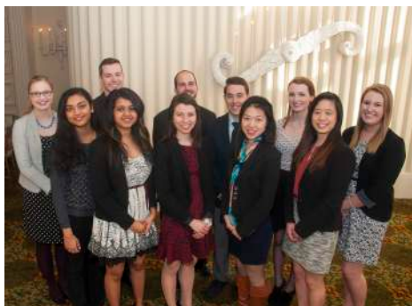
PLS 2015 Inductee

Welcome, student pharmacists! Phi Lambda Sigma (PLS) is a national pharmacy leadership society. The mission of PLS is to recognize leaders within the field of pharmacy and to foster leadership development in our