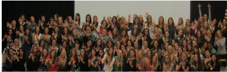
LKS Initiation Fall 2014