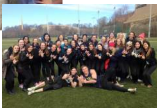
Down: Undefeated powderpuff team 2015