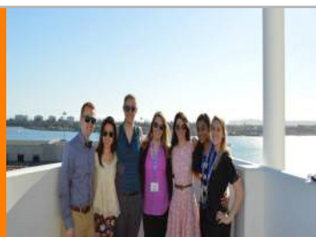
APhA-ASP Eboard 2015-2016